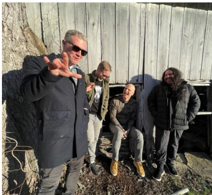
Forests & Fields Band